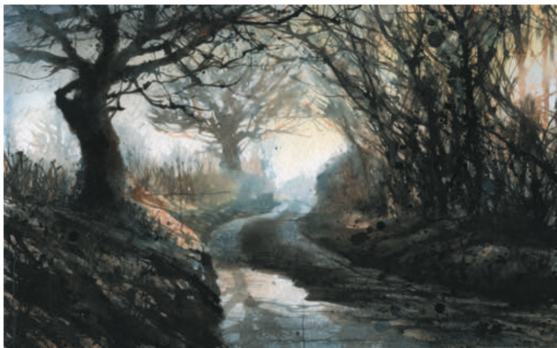
Lockdown lane walks: Poor oak