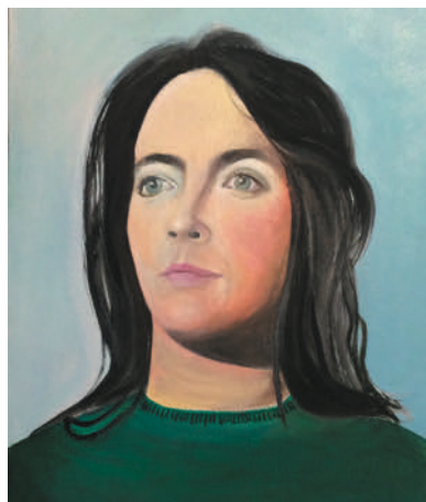
Sally Ridout - Acrylics over gouache