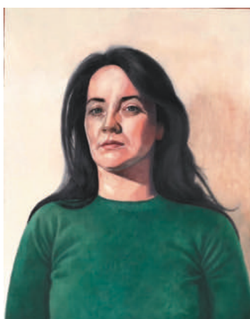
Cathy Ensor - Oil on linen board