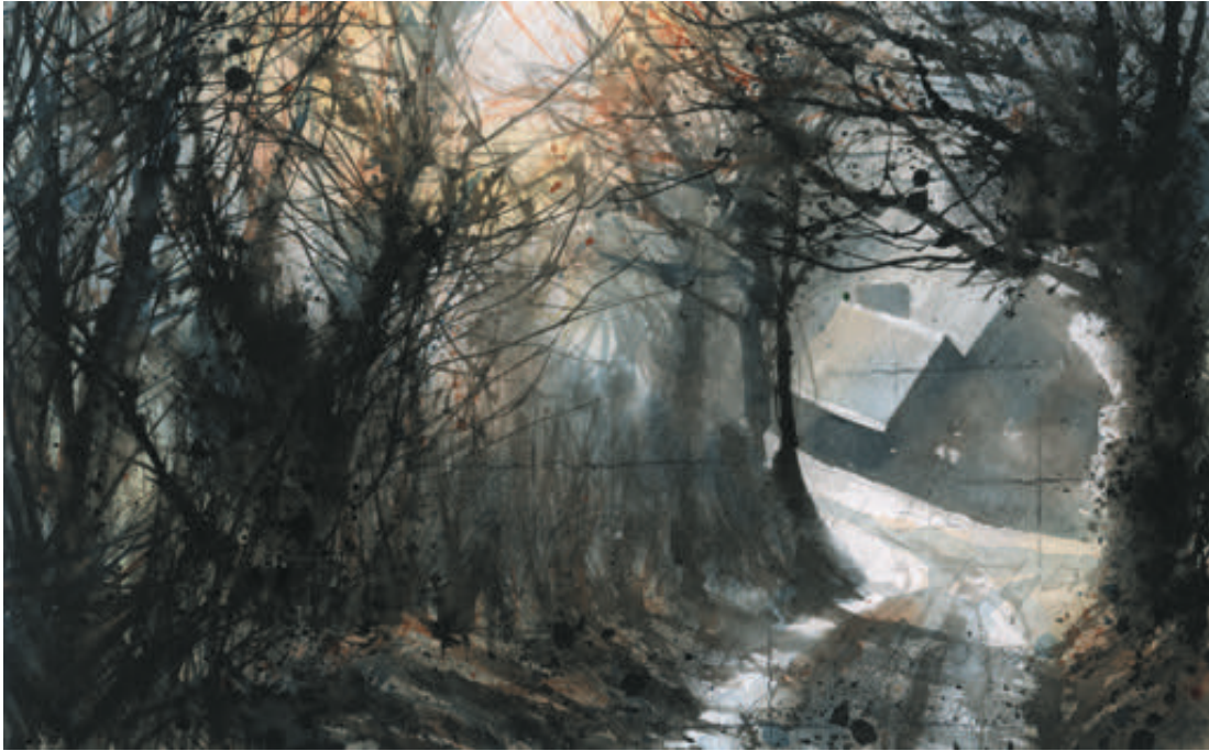
Lockdown lane walks: Steep bit down to the mill