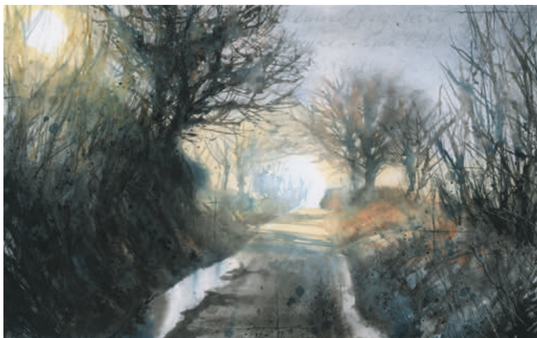
Lockdown lane walks: Icy puddles

I am pleased to be exhibiting with The Arborealists in their Being with Trees show at the Gustavo Bacarissas Gallery in Gibraltar until 30th April and at Bermondsey Project Space, London from April 20 - May 8. A series of works are also on show at Sea Pictures Gallery, Suffolk until May 1