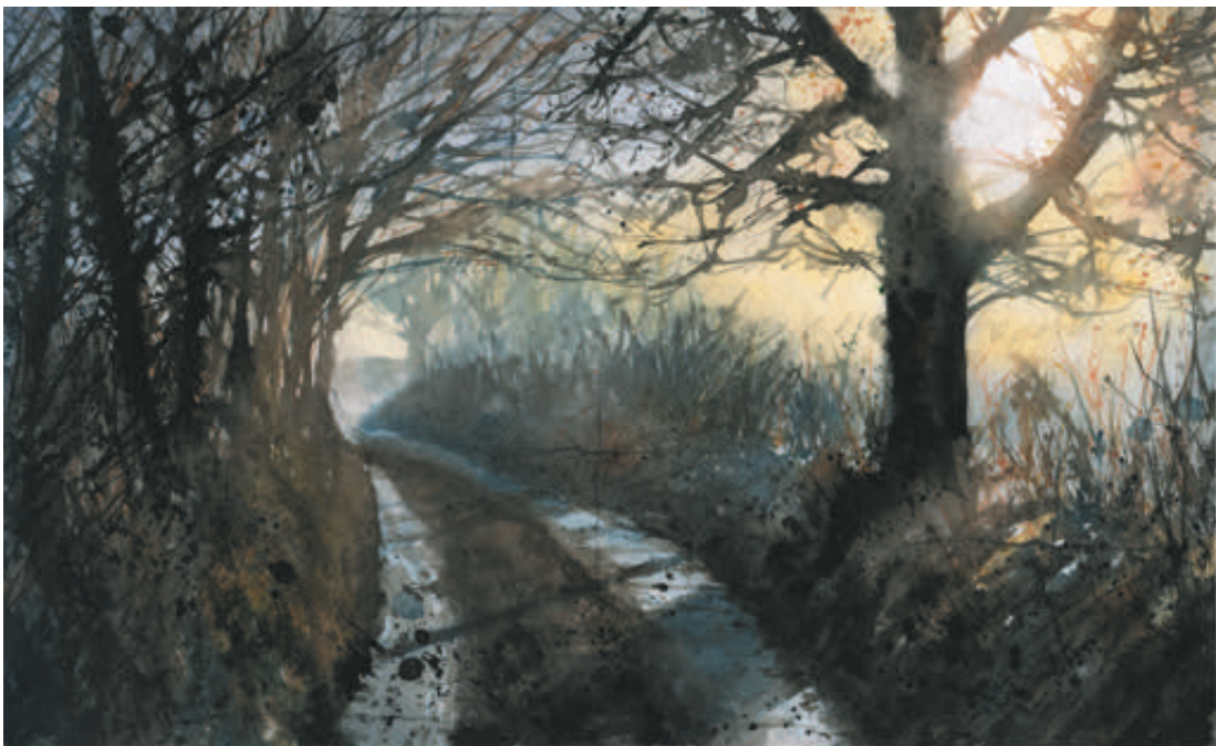
Lockdown lane walks: Warming through the mist