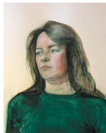
Dorrie Peat - Watercolour