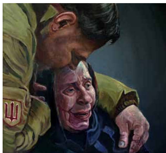
“Mother and Son”