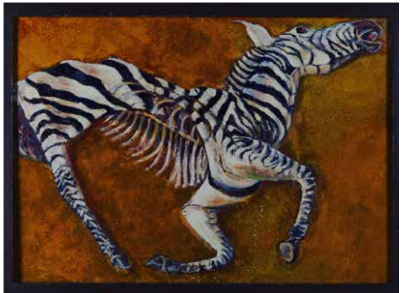
"The Rain Never Came"