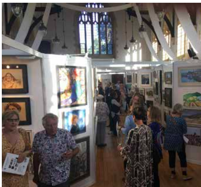
The Private View