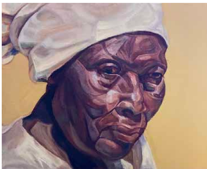
“Colours of the Sudan”