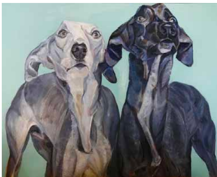
“Shades of Grey”