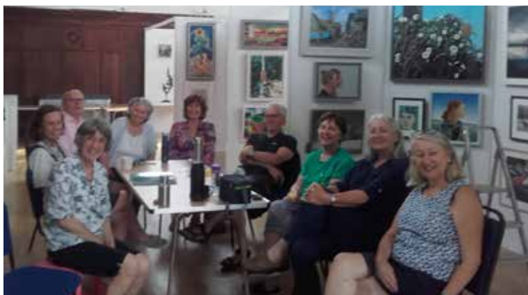
The Hanging Team