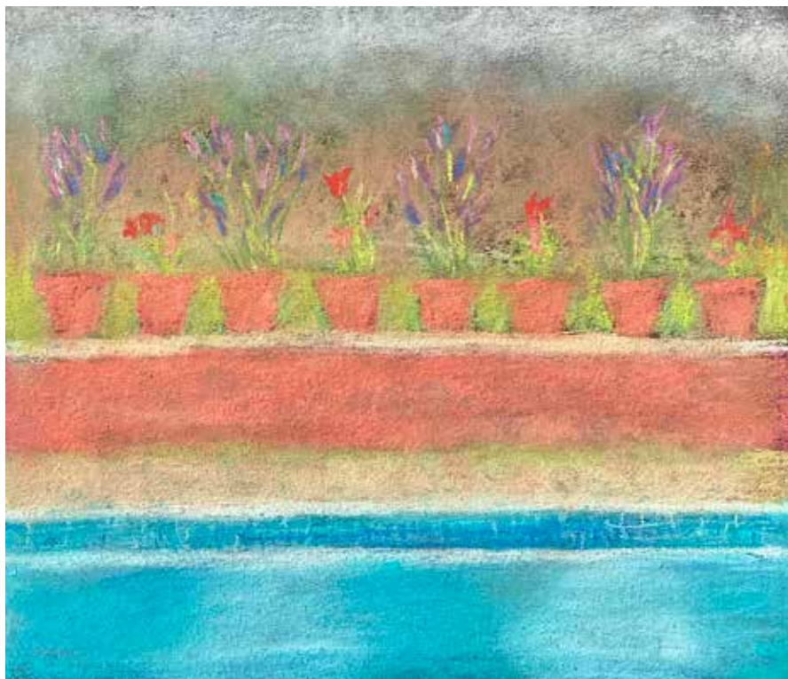
Trish Frowd - Zeals Green House