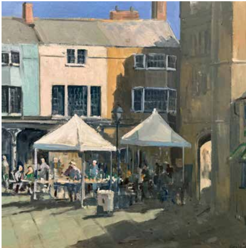
Gillian Flack - Wells Market