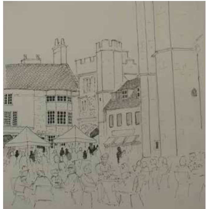
Laurence Belbin - Wells Market