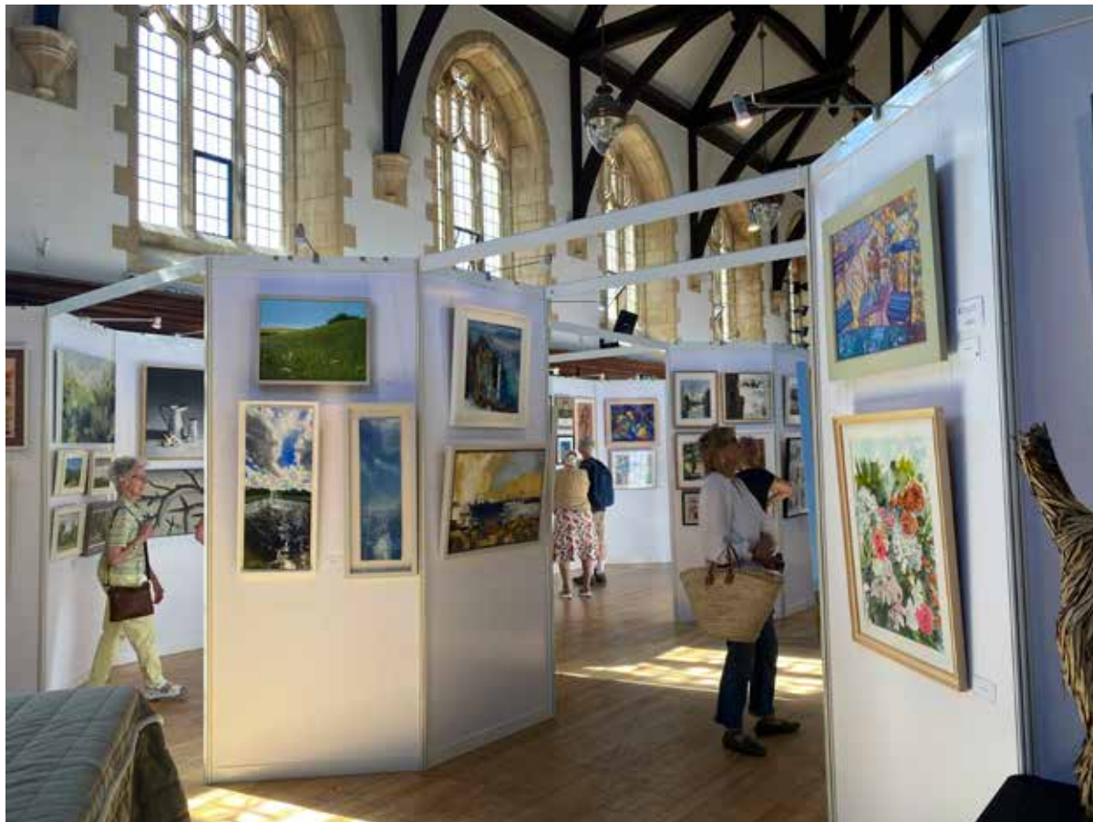
The Exhibition after all the work is done!