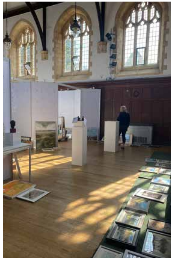
The hanging begins!